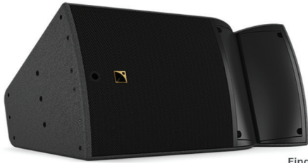
Finalist Most Innovative Audio Hardware

PA (2) L'Acoustics A15i medium throw (2) A15i medium focus